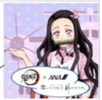
Right side of aircraft

All Nippon Airways is launching three DHC8-400 aircraft featuring a special livery with art and characters of the popular anime TV series "Demon Slayer." The new design will be unveiled on July 14, 2023, with a total of three aircraft entering service by the end of July on domestic routes in Japan. In addition, from July 25, 2023, specially designed stickers will be distributed to passengers traveling on the DHC8-400 aircraft, which can be used to activate augmented reality (AR) photo frames. The new aircraft are an addition to the Demon Slayer collaboration which began in December 2021.