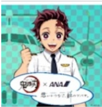
Left side of aircraft