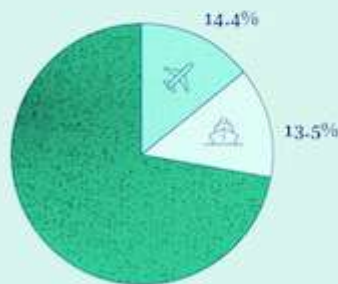
EU transport emissions (based on latest available data from 2018)

Aviation and maritime transport account for 14.4% and 13.5% of EU transport emissions, respectively.