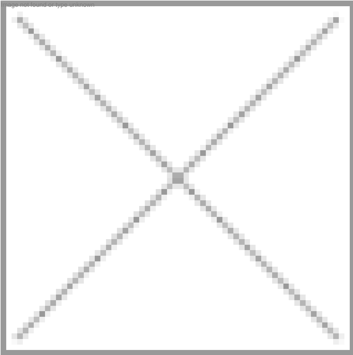
Untitled [Propaganda Drop], Fédèle Azari, between 1919 and 1929.