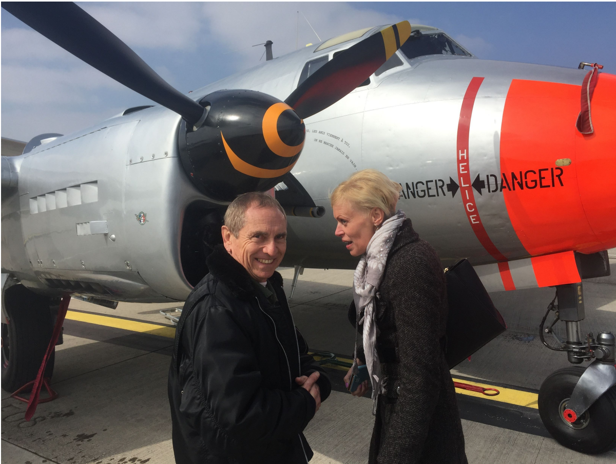
Each year No. 226 is delighting audiences in French or European airshows.