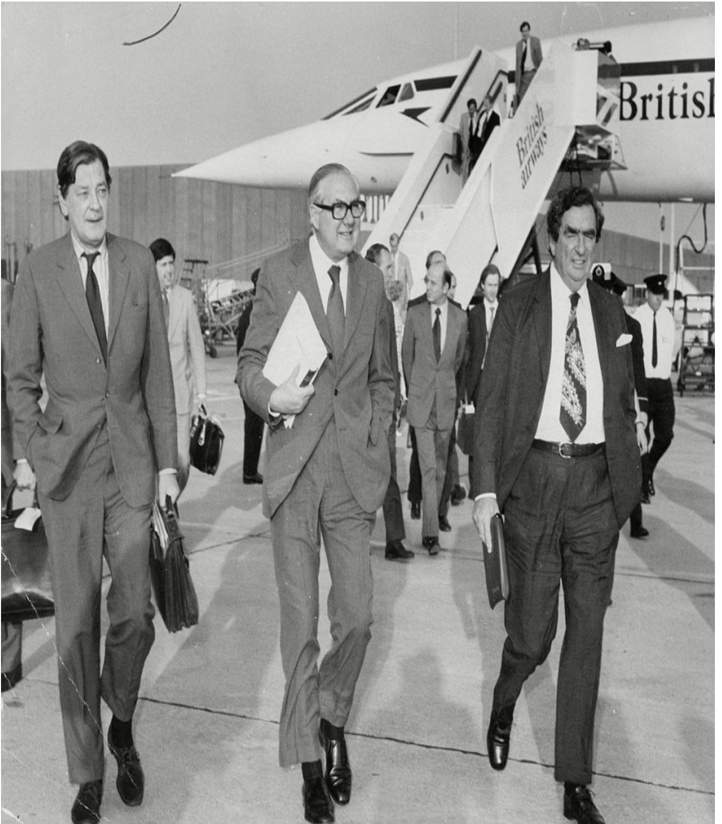
It was used by Britain's rich and powerful. From left to right, MPs, Anthony Crosland, Prime Minister, James Callaghan (Lord Callaghan of Cardiff) and Denis Healey (Lord Healey), after flight on Concorde