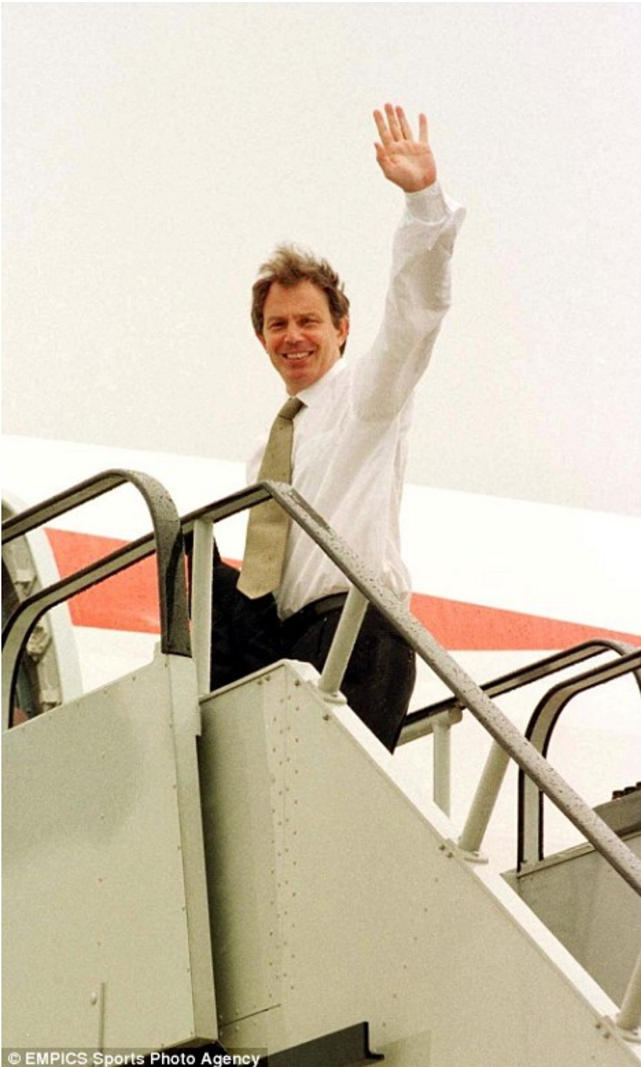
Successive British Prime Ministers John Major (left, in 1995) and Tony Blair (in Denver, USA) on the steps to the famous aircraft