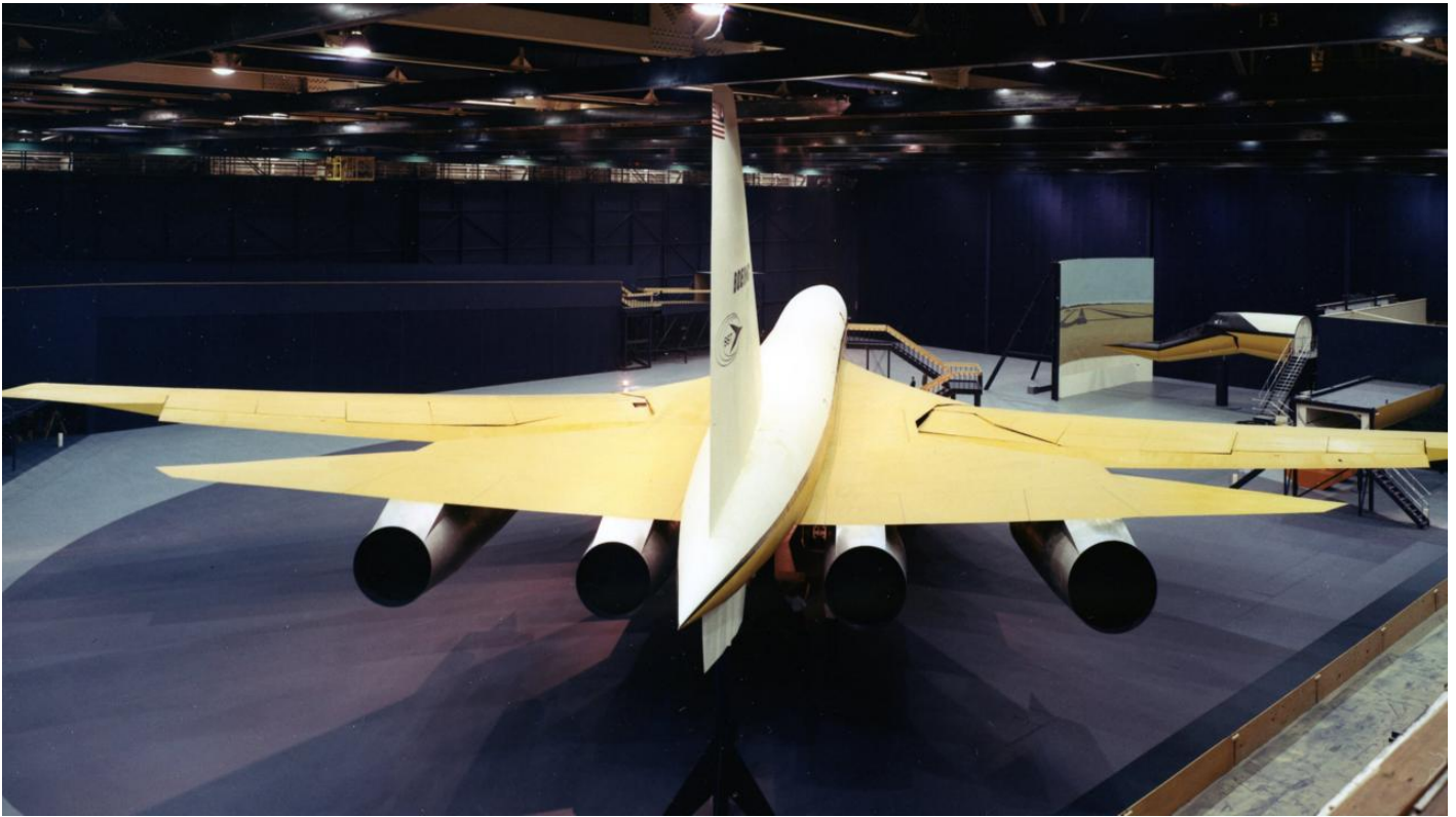
The 2707 project was Boeing's major priority during the late 1960s

Mitchell says that the 2707's extra speed would have caused enormous challenges for every single part of the aircraft. At such speed, the aircraft experiences enormous heating – parts of Concorde's metal skin heated to well over the boiling point of water; the very tip of the nose could be as hot as 127C when cruising at Mach 2. "Everything – from the sealants, to the electrical wiring, to the windows, you name it, had to especially designed for a 'hot' airplane.