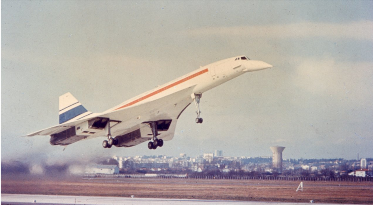
Concorde taking off from Toulouse