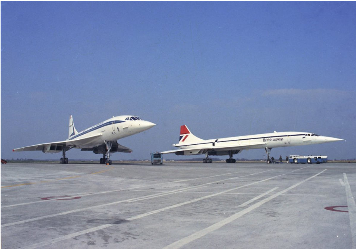
Concorde with Air France and British Airways paint schemes

It took seven years to arrive at the first flight that March afternoon. Many innovations resulted, from electronic flight controls and the first cockpit sidestick to anti-skid braking systems and the movement of fuel around the aircraft in flight to adjust its centre of gravity. The experience the French and British gained during Concorde's development meant some pitfalls were avoided when Airbus was created – such as the politically-motivated dual assembly lines, one in each country.