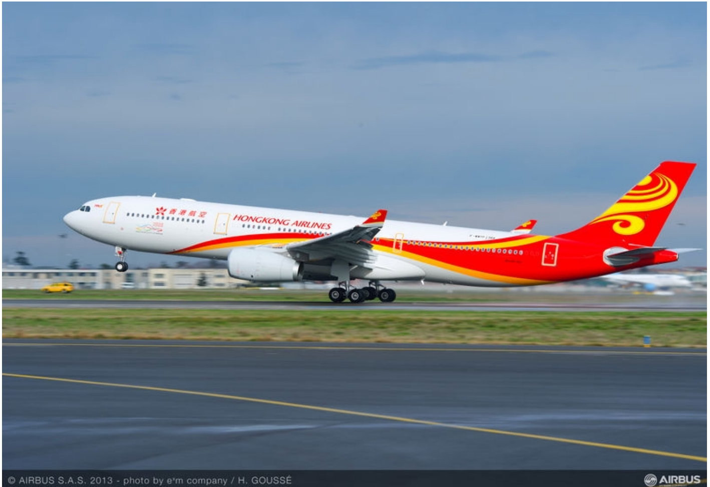
© AIRBUS S.A.S. 2013 - photo by e'm company / H. GOUSSÉ