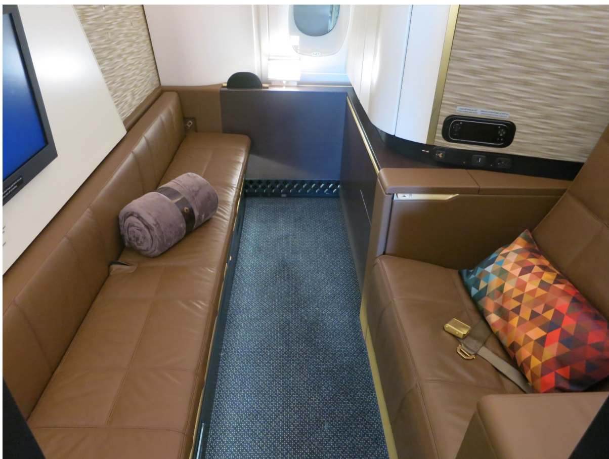
Etihad First Apartment