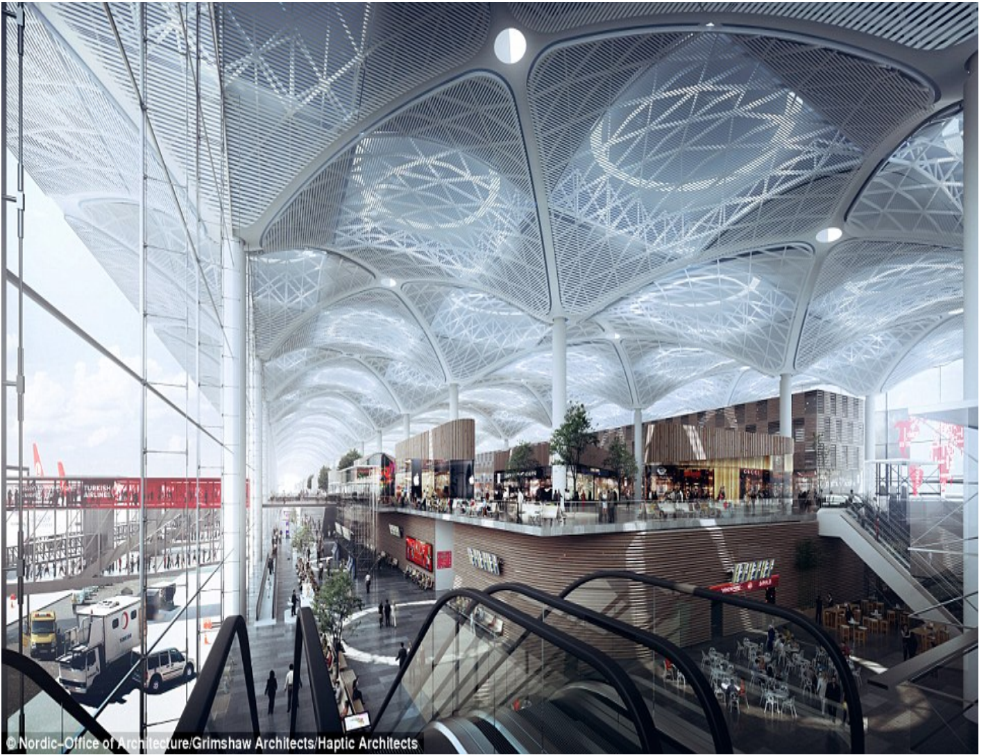
Istanbul New Airport – the name given to the project so far – will serve as Turkey’s primary airport and a major hub for connecting flights