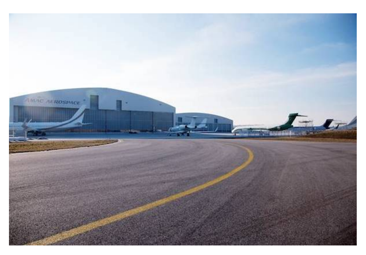
13 NOVEMBER 2020