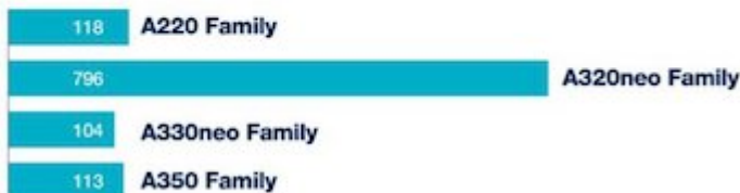
Passenger Aircraft Gross Orders 2019

Net orders reached 768, compared to 747 in 2018, underlining customer endorsements in all market segments and taking Airbus' overall historical cumulative net orders over the 20,000 mark.