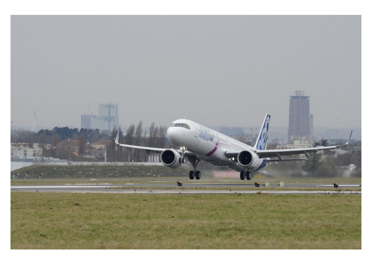
14 FEBRUARY 2018