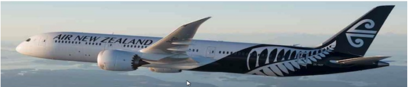
Airplane deliveries: 950