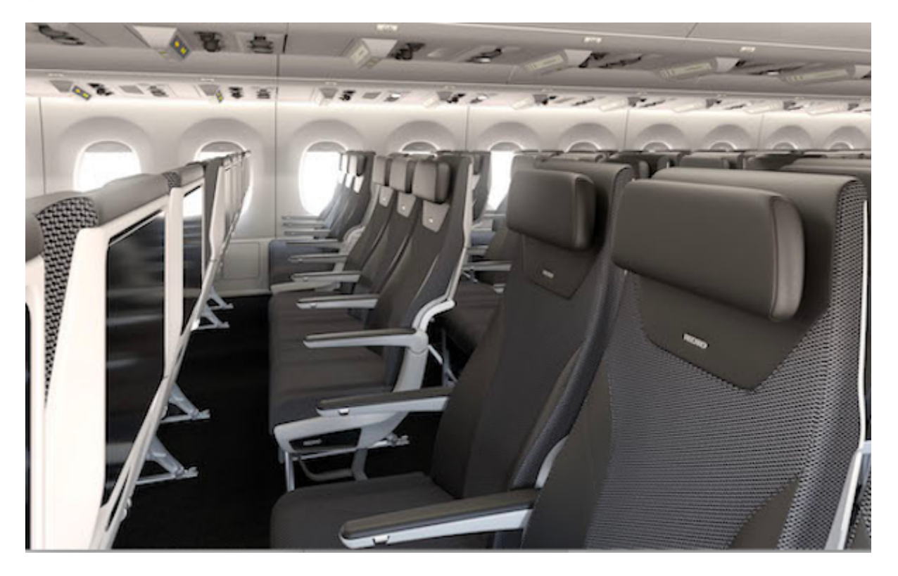
13 SEPTEMBER 2021

Germany-based Recaro has been building aircraft seats for nearly 50 years, and today has five manufacturing sites on four continents. Most recently, the global seat supplier expanded into the regional jet market, revamped its flexible seating solutions targeting lessors, and unveiled its next generation of lie-flat business class seat.