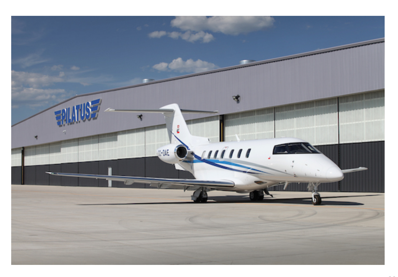
26 AUGUST 2019